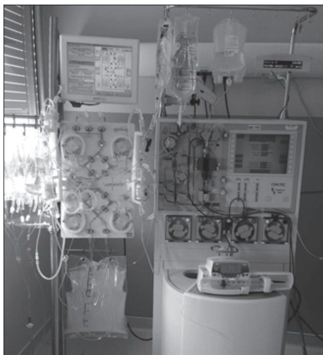
Figure 1. The generators used to perform immunoadsorption. On the left of the image is the ADAorb® generator, and on the right hand side, the Com.Tec® generator

In the setting of HLAi kidney transplantation, the recipient may have donor-specific alloantibodies (DSA) at pre-transplant. DSA can then act against HLA class I (A, B, or Cw) and/or HLA class II (DR, DQ, or DP) antigens. If DSAs are left, they quickly cause acute antibody-mediated rejection at posttransplant, despite immunosuppression [12]. Therefore, for pairs in whom the recipient has DSA(s) against the donor, we need to implement a desensitization protocol at pre-transplantation. This relies: 1) on removing DSAs by via plasmapheresis, 2) preventing their subsequent synthesis using rituximab infusion; and 3) starting conventional immunosuppression, i.e., tacrolimus, mycophenolic acid, and steroids at 7–10 days pre-transplantation [11]. Desensitization can also include intravenous IV-Ig infusions (for